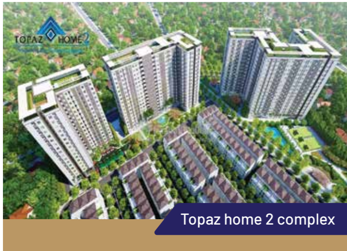
Topaz home 2 complex