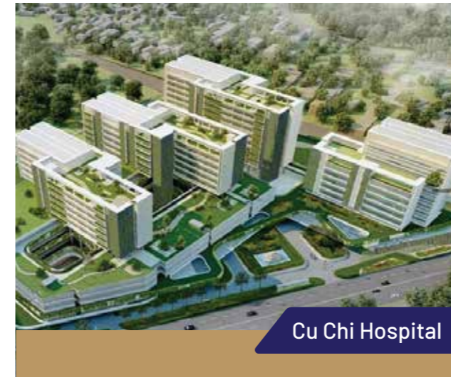
Cu Chi Hospital