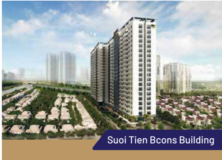
Suoi Tien Bcons Building