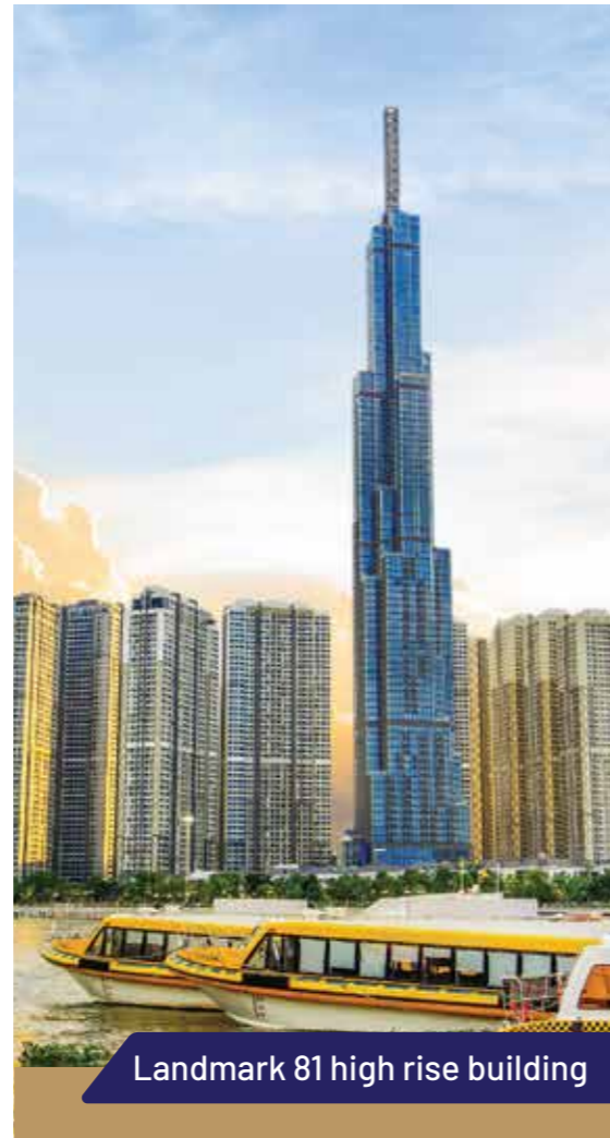
Landmark 81 high rise building