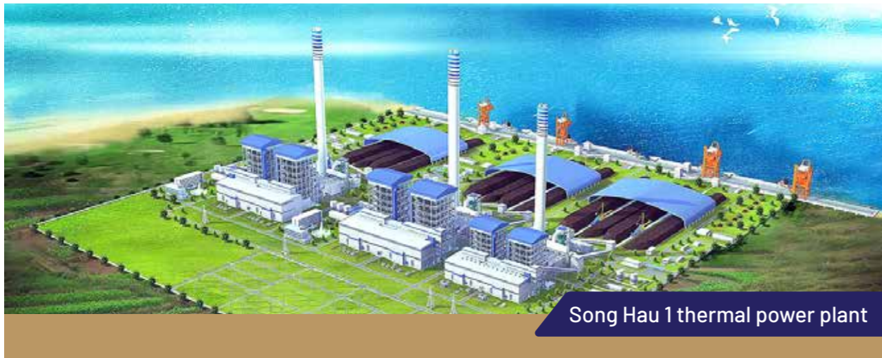
Song Hau 1 thermal power plant