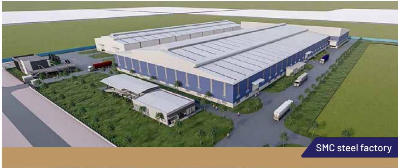
SMC steel factory