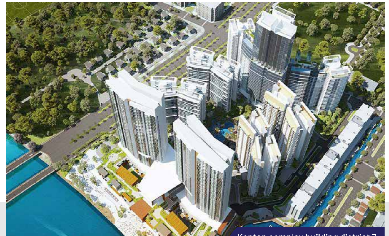
Kenton complex building district 7