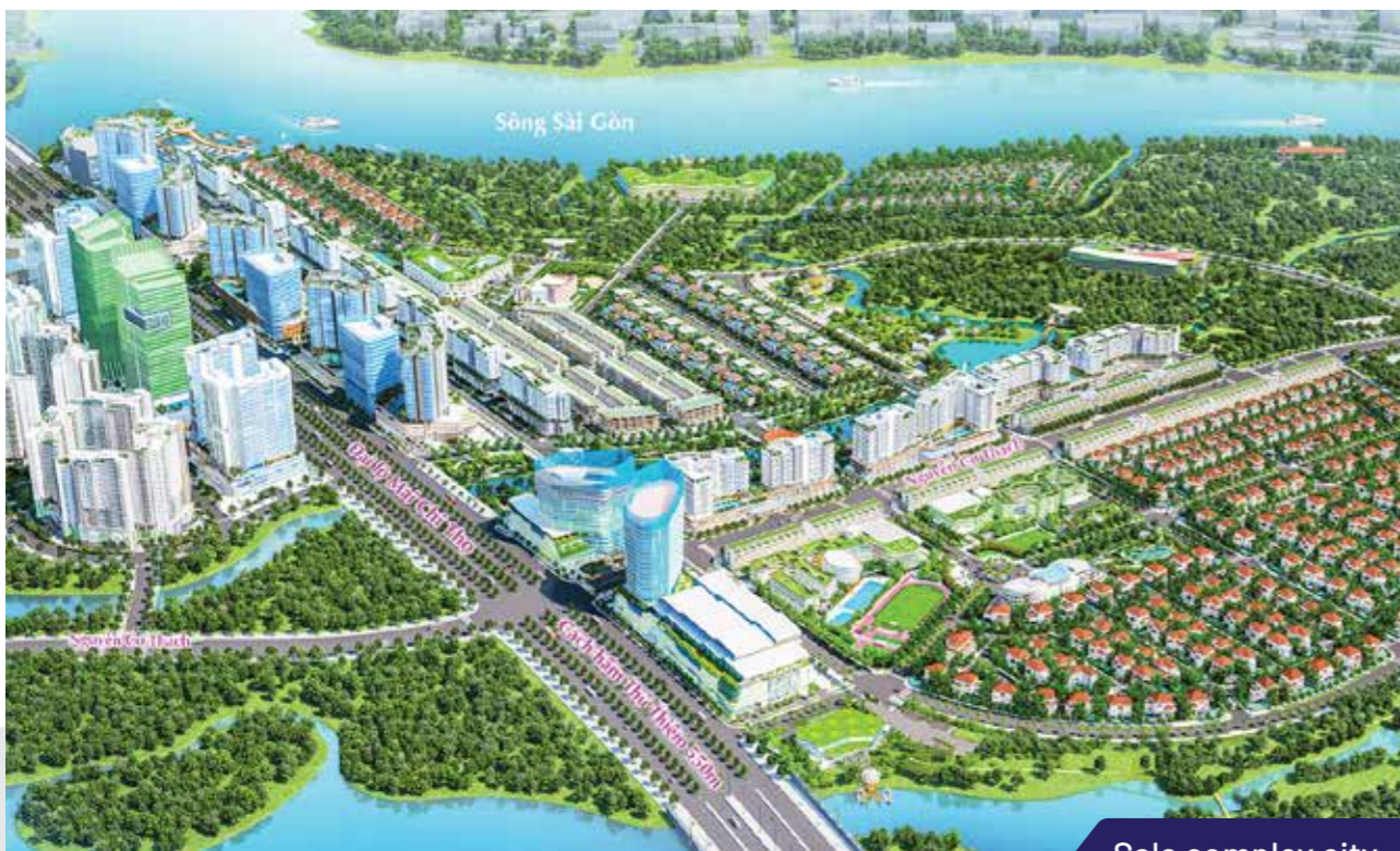
Sala complex city