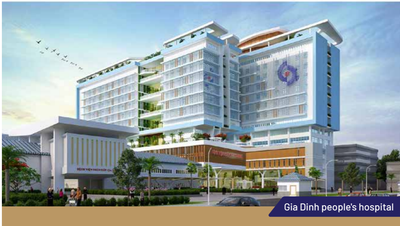
Gia Dinh people's hospital