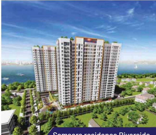
Samsora residence Riverside

Over the years, Hoang Chau's products has been accounted for high market shares and trusted by customers who are the leading general contractors for large projects across the country. Hoang Chau branded products are always the top brands trusted and chosen by Customers.