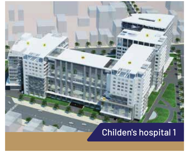
Children's hospital 1