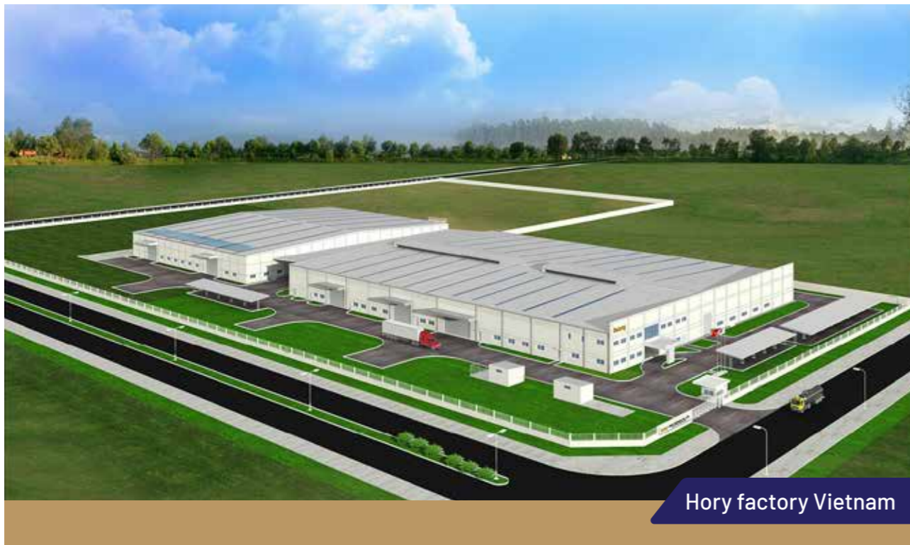
Hory factory Vietnam