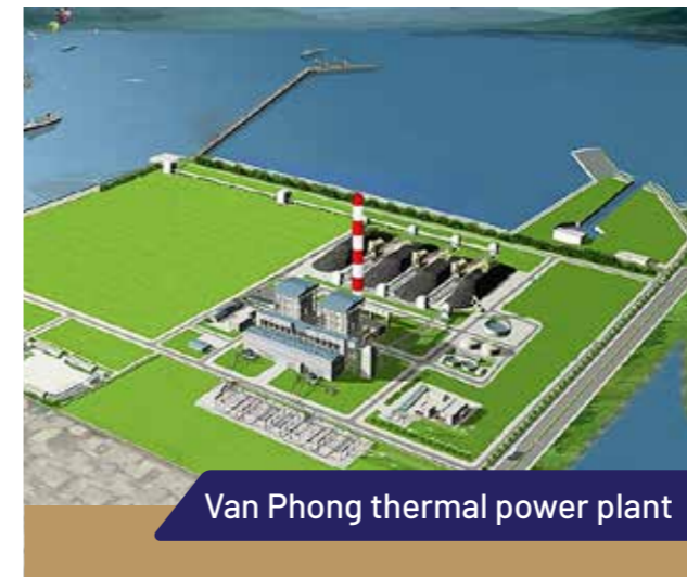
Van Phong thermal power plant