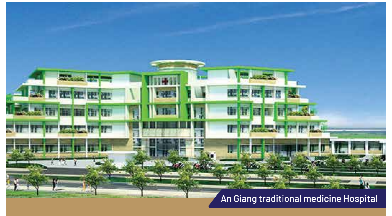
An Giang traditional medicine Hospital