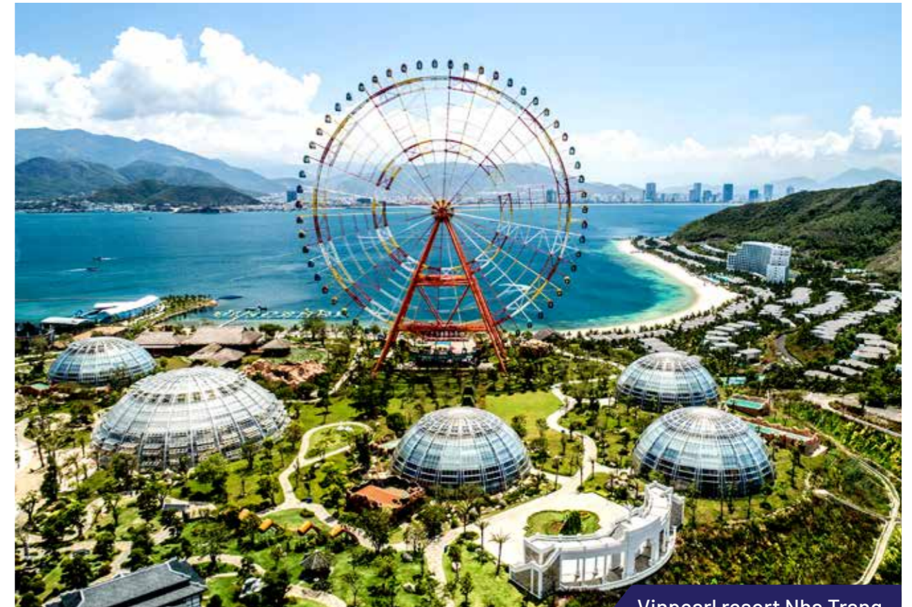
Vinpearl resort Nha Trang

Hoang Chau has always kept in mind that our mission is to manufacture highest quality products with the most reasonable price to meet variety demands of customers with the most professional customer services.