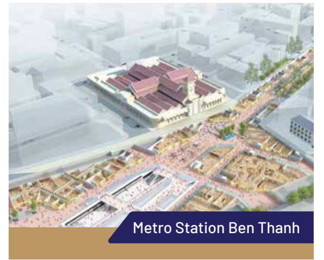
Metro Station Ben Thanh